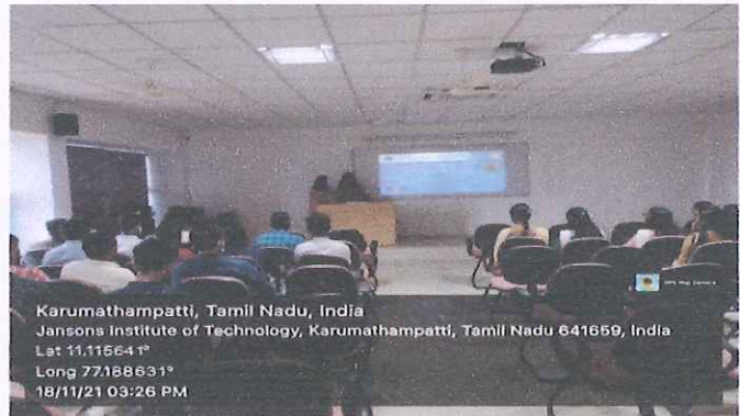
Food waste Management awareness Programme conducted by NSS on 18.11.2021 at Seminar hall, JIT for the students of various departments