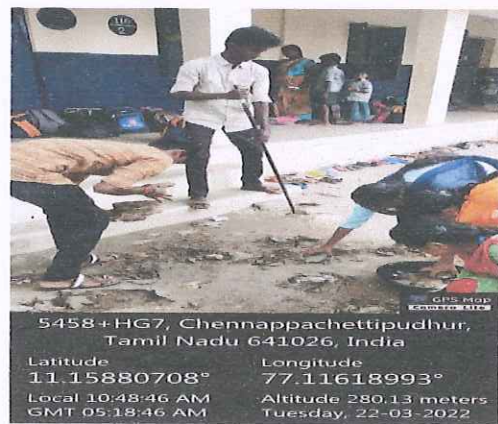
Removal of rocks before the main block by NSS volunteers