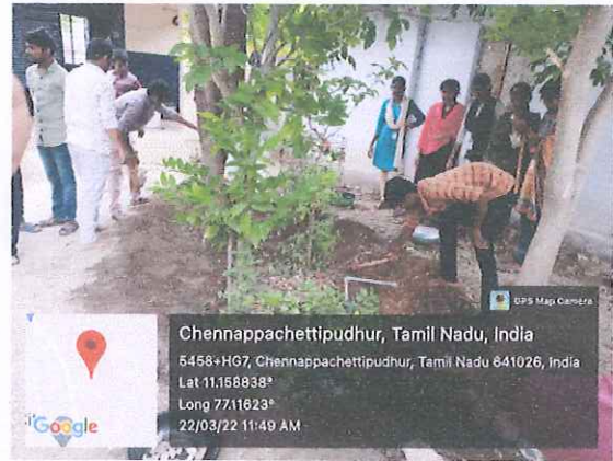
Removal of weeds in the ground of school campus on 22.03.2022