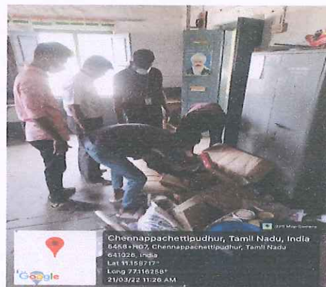
Collection of waste papers inside the school building

[Signature] Faculty In-charge Programme Officer National Service Scheme Jansons Institute of Technology Coimbatore - 641659.