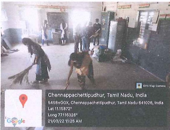
Cleaning the classrooms of PUPS, Chennappachetti pudur on 22.03.2022