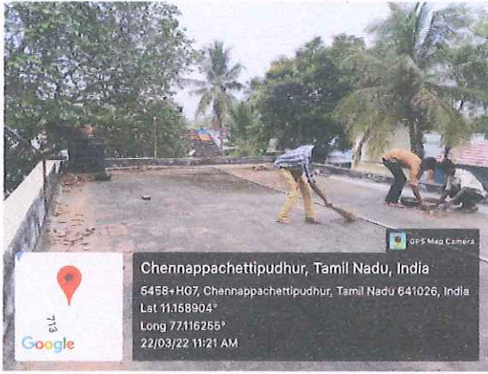
Volunteers sweeping the terrace of PUPS on 22.03.2022