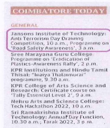
Flyer used for the event Anti-Terrorism Day