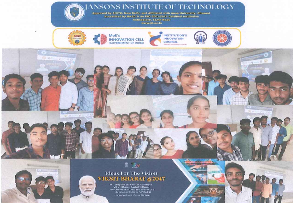
Fig. 3. Selfies by the students with the Viksit Bharat 2047 banner