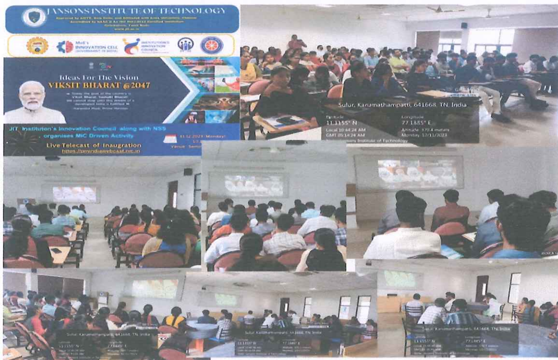
Fig. 1. Students listening the speech by Honourable PM on Visit Bharat 2047

Photo Collage of the MIC driven event on “ Viksit Bharat 2047-Voic of the Youth” –Speech by Honorable Prime Minister Shri Narendra Modi ji on 11.12.2023. The Event was organised by JIT IIC and NSS