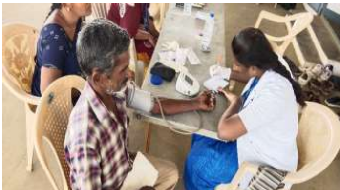
Nurse checks the BP for the person in Free Eye Checkup Camp on 26.02.2025