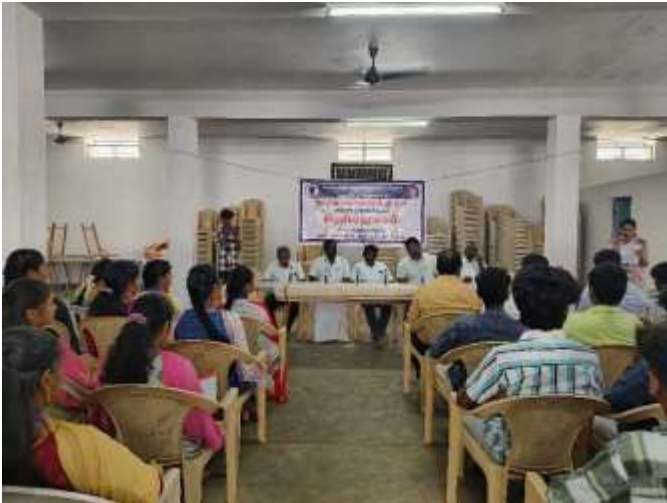
Inauguration of NSS Special Camp at Unjapalayam on 24.02.2025