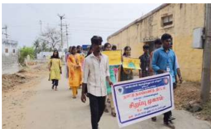
NSS volunteers done a campaign for climate change awareness at Unjapalayam village on 01.03.2025