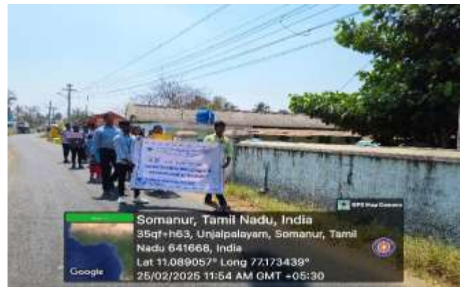
NSS volunteers created an awareness at Unjapalayam village on 25.02.2025