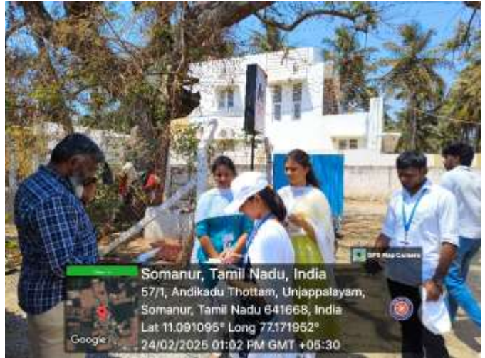
NSS Volunteer taking survey at Unjapalayam for Special Camp on 24.02.2025