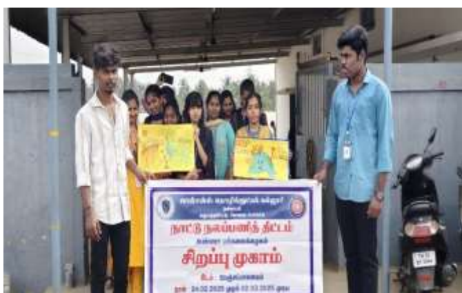
Our volunteers get prepared for climate change Awareness Program on 01.03.2025