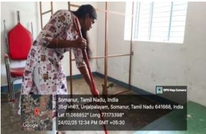
Cleaning Activity done by NSS Volunteer for NSS Special Camp on 24.02.2025