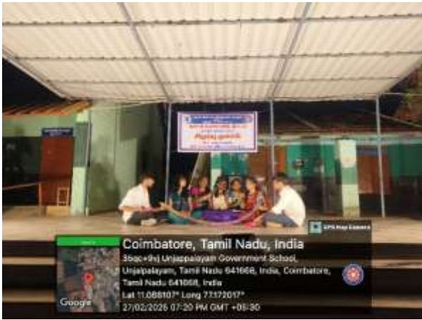
NSS volunteers done a traditional singing performance at Unjapalayam village on 27.02.2025