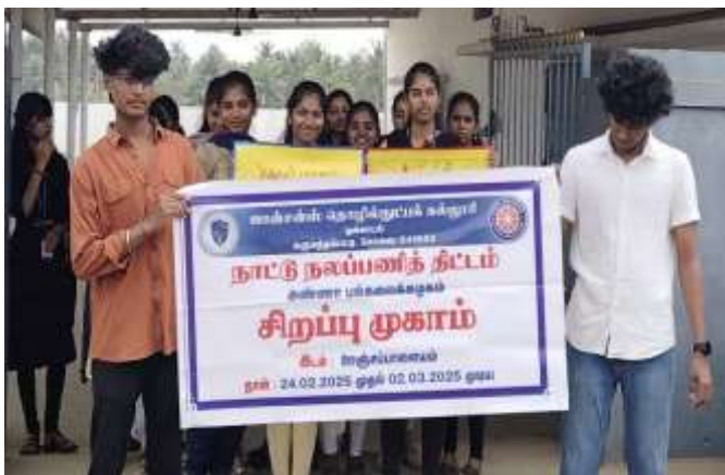
Our volunteers get prepared for Cyber Security Awareness programme on 28.02.2025