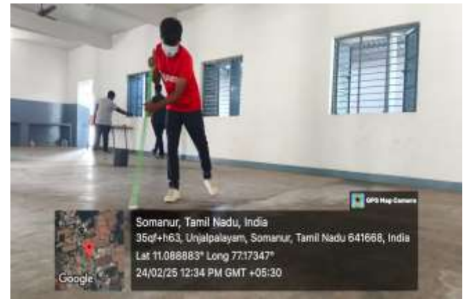
Cleaning Activity done by NSS Volunteer for NSS Special Camp on 24.02.2025