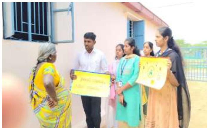
NSS volunteers explains the cyber threat given in the society on 28.02.2025