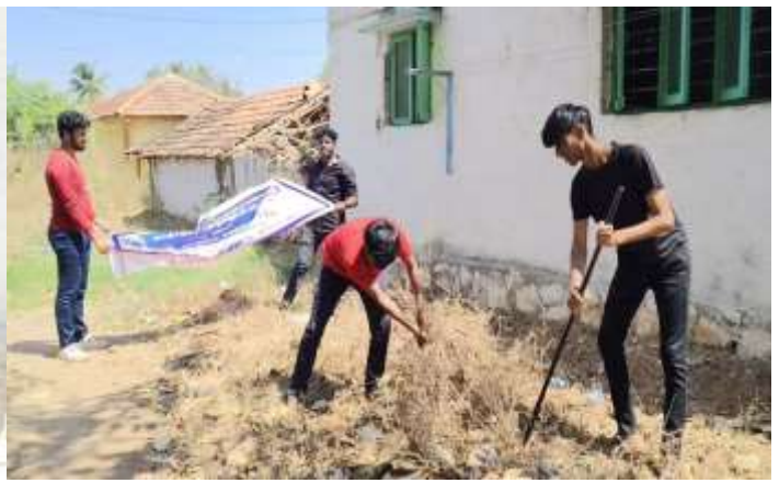
NSS volunteers removed the weeds and disposed in garbage at Unjapalayam village on 28.02.2025