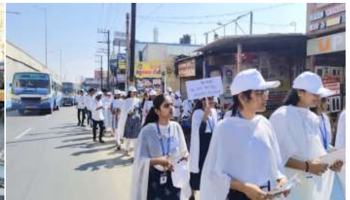
NSS volunteers done campaign on Drug Free Tamilnadu Awareness in this Rally on 27.02.2025