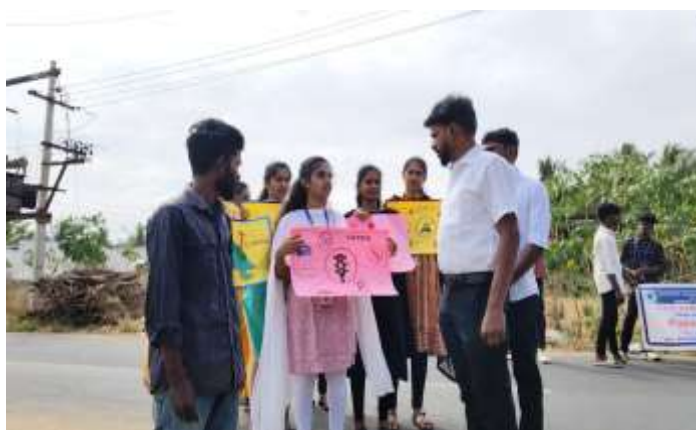
NSS volunteers explains the traffic regulations to the people on 28.02.2025