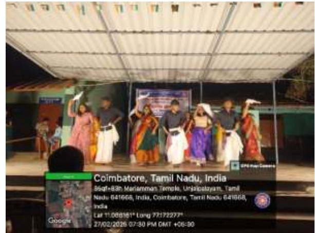
NSS volunteers performed a traditional dance performance at Unjapalayam village on 27.02.2025