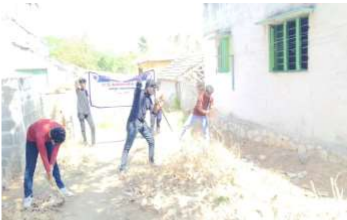
NSS volunteers cleaned the weeds surrounded around the Unjapalayam village on 28.02.2025