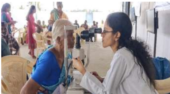
Nurse checks the condition of eye through microscope or the person in Free Eye Checkup Camp on 26.02.2025