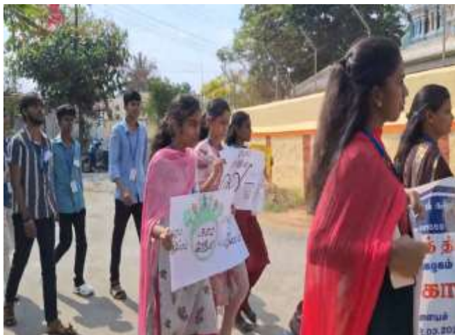
NSS volunteers done their campaign among the village people in Unjalpalayam on 25.02.2025