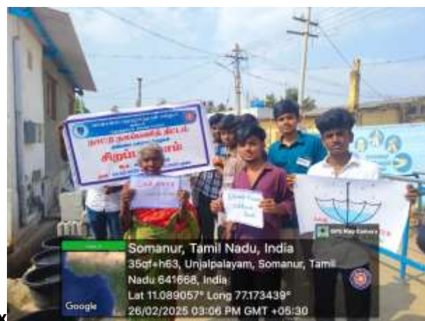
Unjalpalayam people supports our water conservation Awareness Program on 26.02.2025