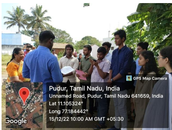
Energia Club Members explaining about Energy Conservation to public on 15.12.2022