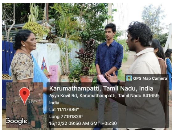
Energia Club Members explaining about Energy Conservation to public on 15.12.2022