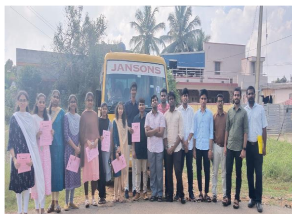
Group photo of student participants during campaign on 15.12.2022