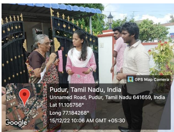
Energia Club Member explaining about Energy Conservation to public on 15.12.2022