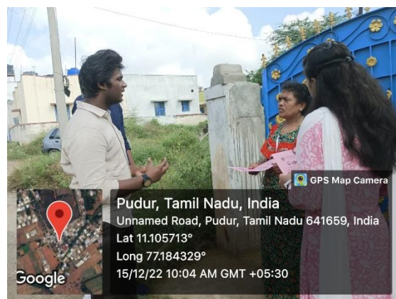
Energia Club Members explaining about Energy Conservation to public on 15.12.2022