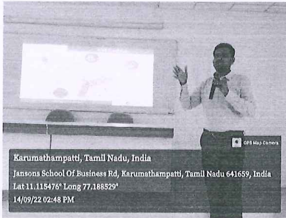
A Seminar on "Innovative Product Development in Smart Automation" on 14.09.2022