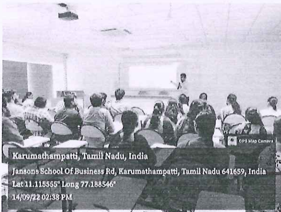
Insights on Innovative product development during the session