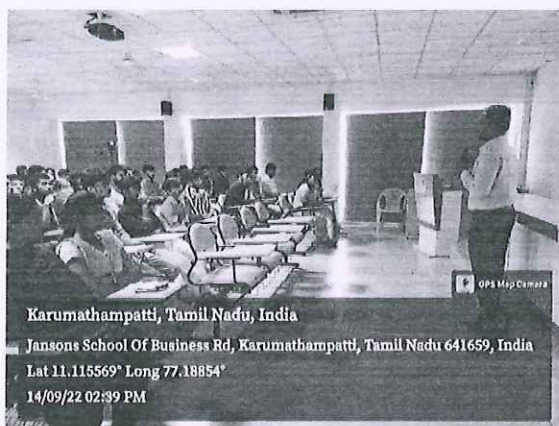
Students interaction with Resource Person