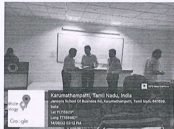
Felicitation of the Resource Person with Memento