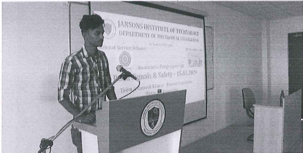
Interaction with students participants