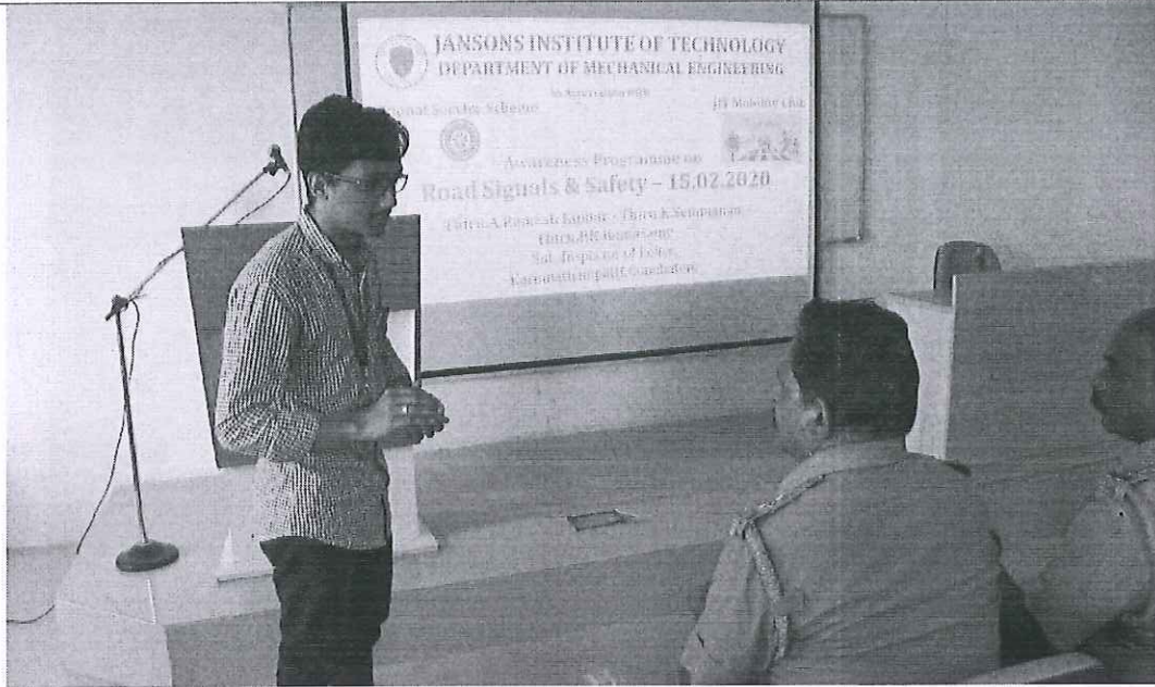
Interaction with students participants