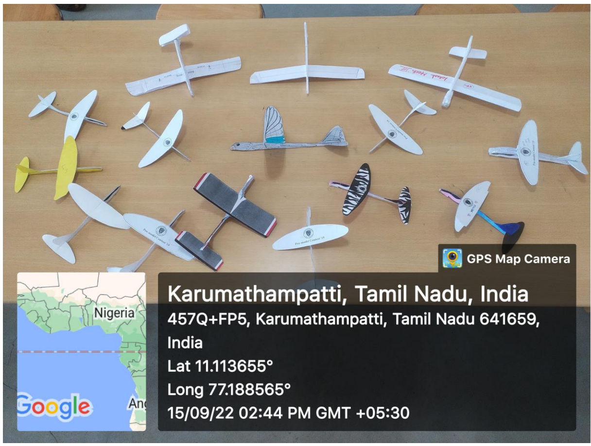
Paper Glider Models prepared by the student participants for the event