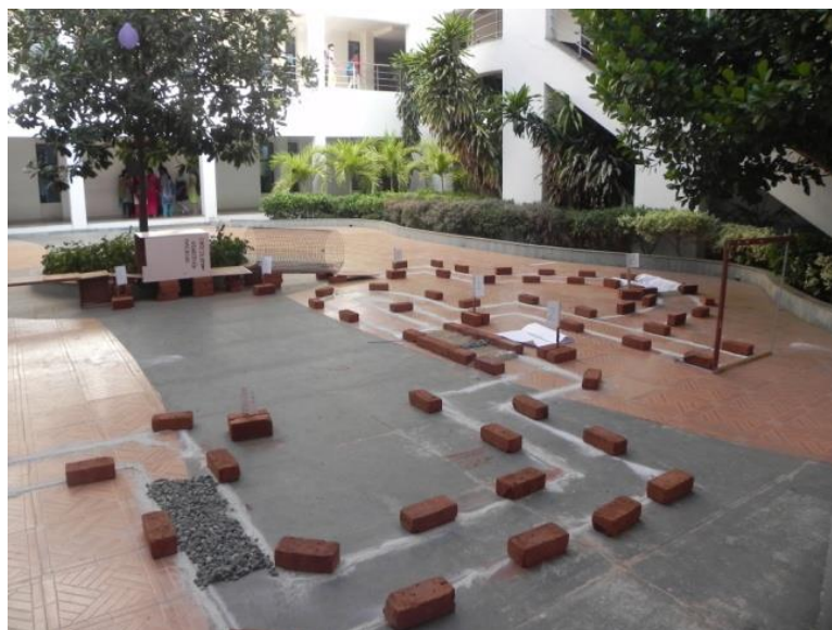
Event: Robo race