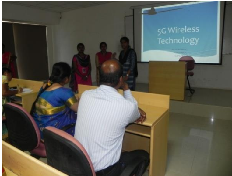
Event: Paper Presentation