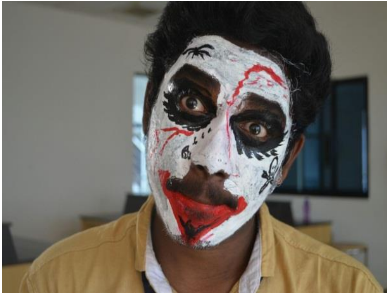
Event: Face painting