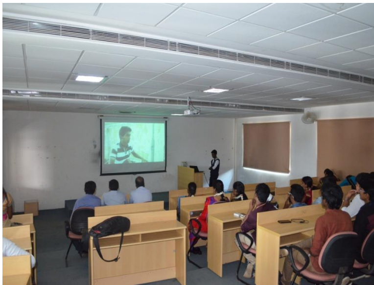
Event: Short Film