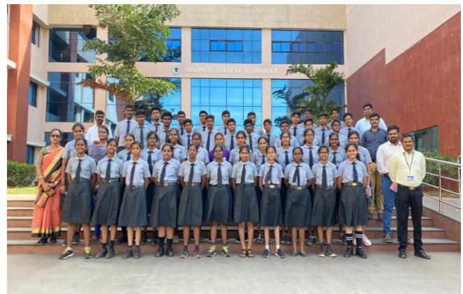
Group Photo With Plato School Students