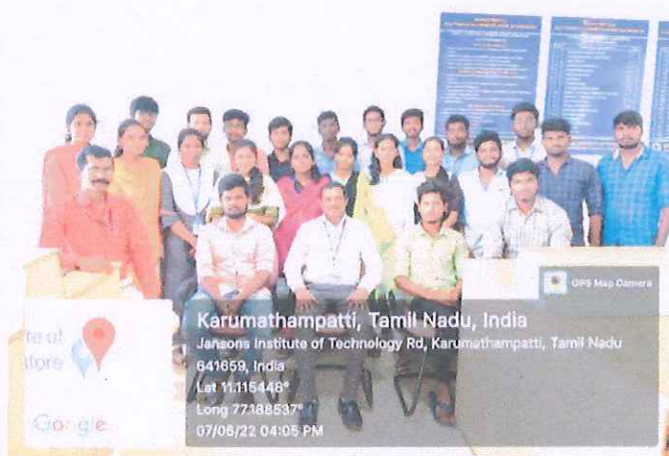
Group Photo with Students Participants