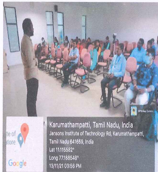
Interaction with students Q&A Session