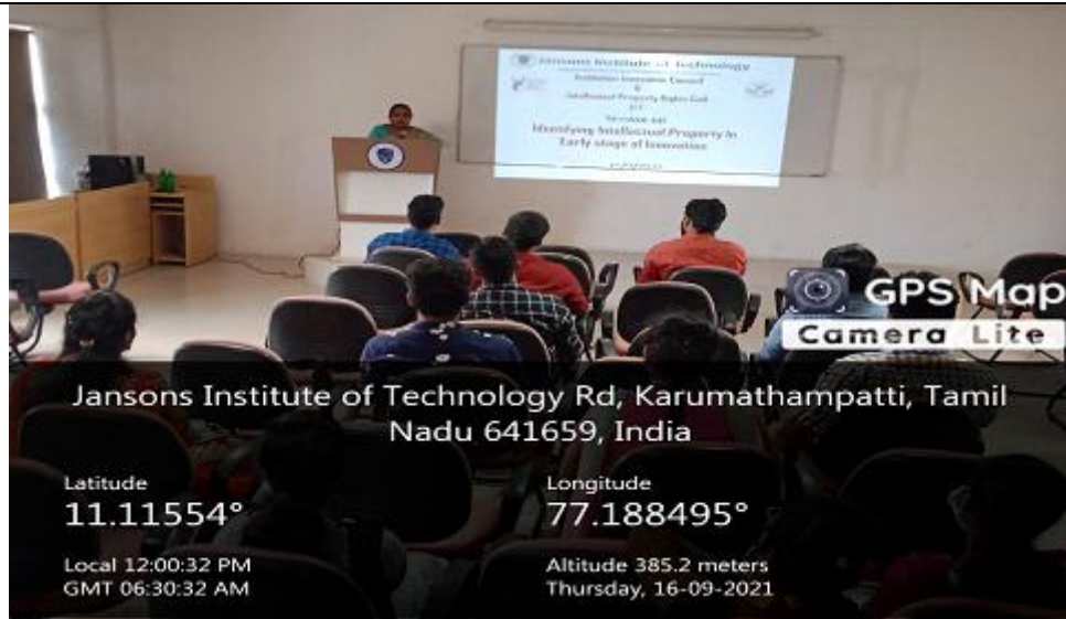
Figure 4 Session on Identifying Intellectual property in early stage of Innovation by Dr.T.Meenakshi, IPR cell coordinator