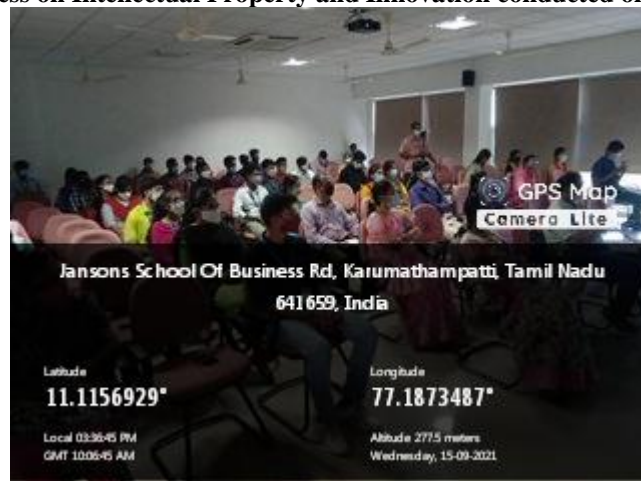
Figure 2 Session on Role of patents in Engineering domain and types of protection- 16.9.21, Student audience listening to the seminar