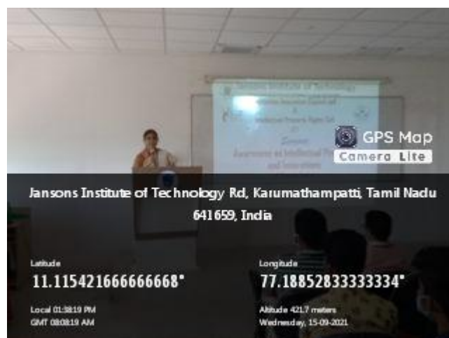
Figure 3 Dr.E.S.Shamila, Editor of IJCESET journal addressing the audience on copyright