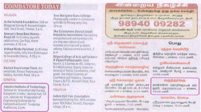
Paper clipping The Hindu and Dinamalar