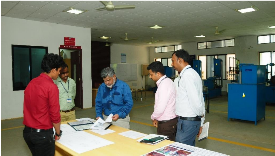
Fig. 9 Visit to Civil Engineering Department