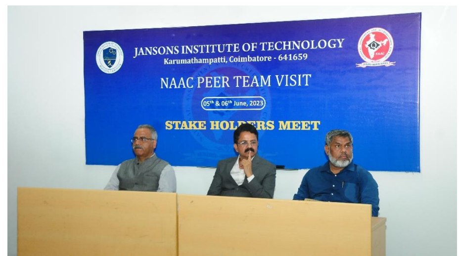
Fig. 28 Meeting with Stakeholders