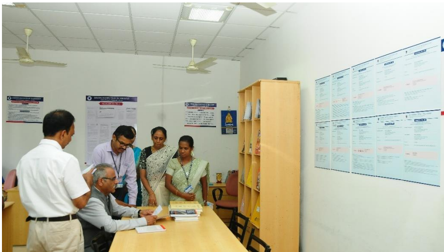
Fig. 14 Visit to Research Wing - Intellectual Properties Rights Cell – Entrepreneurship Development Cell – Institution Innovation Council – CIIE