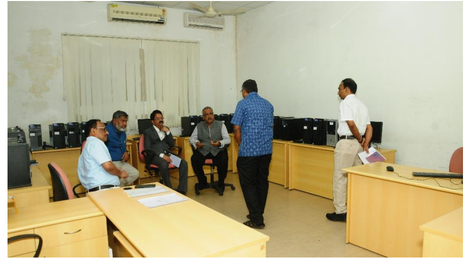
Fig. 19 Visit to JIT eEDU – IT Facility