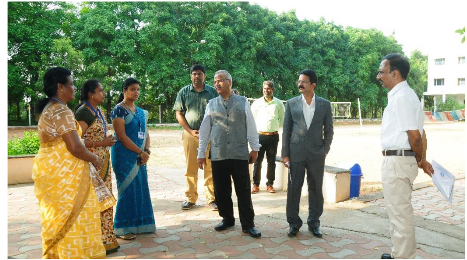
Fig. 32 Discussion with Hostel Staff – Deputy Warden – Tutors