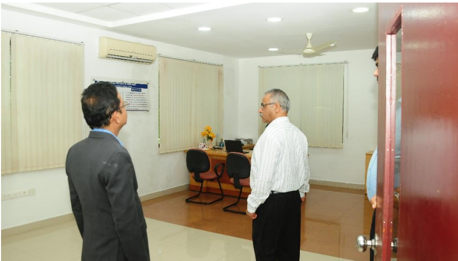
Fig. 42 Visit to Principal Office