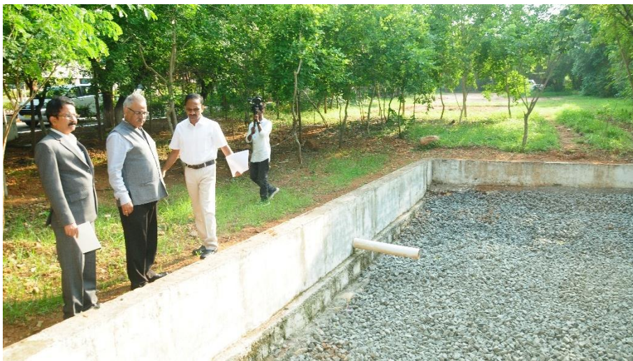
Fig. 38 Visit Rainwater Harvesting Facility