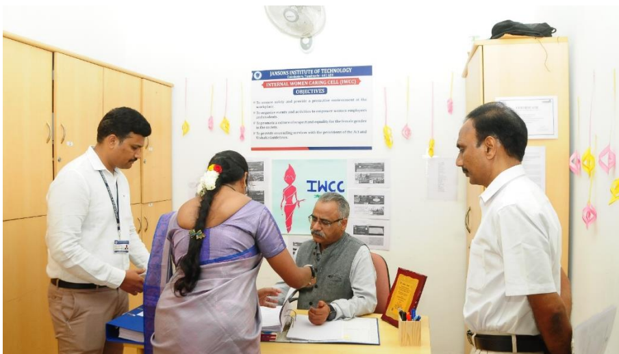
Fig. 26 Visit to Office of Various Committees – Internal Women Caring Cell (ICC)