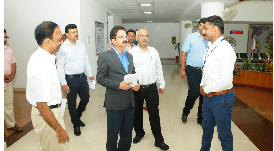
Fig. 43 Interaction with PED – Yoga Trainer