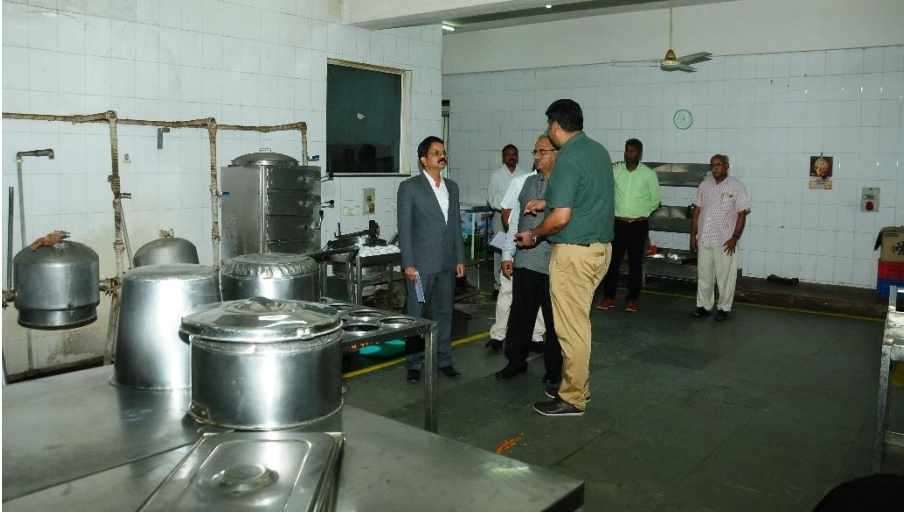
Fig. 33 Discussion with Hostel Staff – Mess In-charge