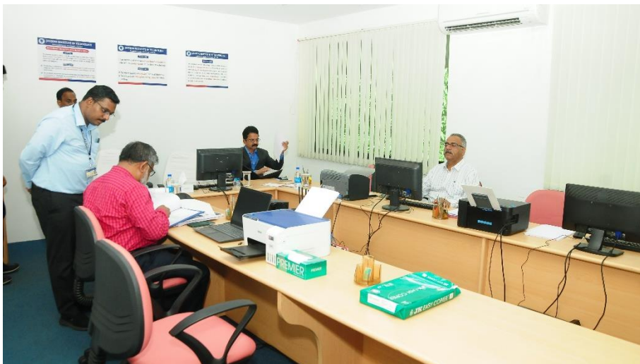
Fig. 46 Document Verification at IQAC