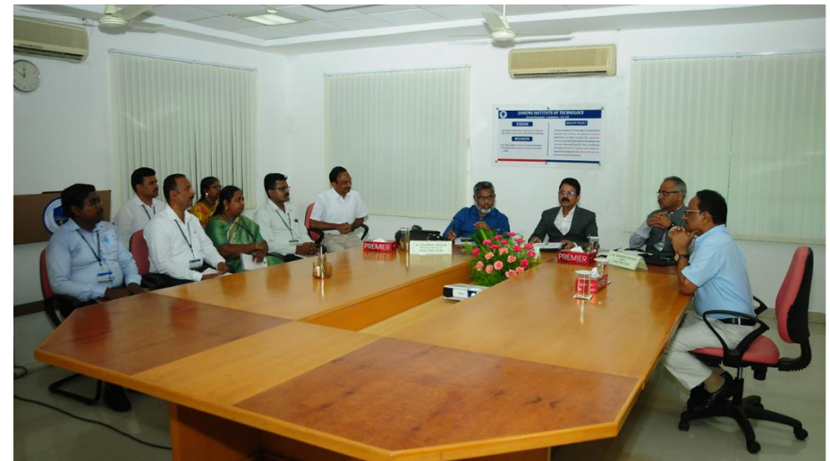
Fig. 4 NAAC Peer Team interaction with Heads of Department