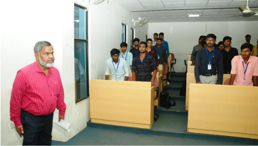
Fig. 41 Visit to Classroom