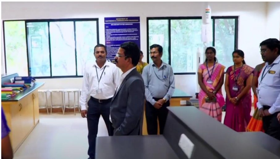
Fig. 6 Visit to Electronics and Communication Engineering Department