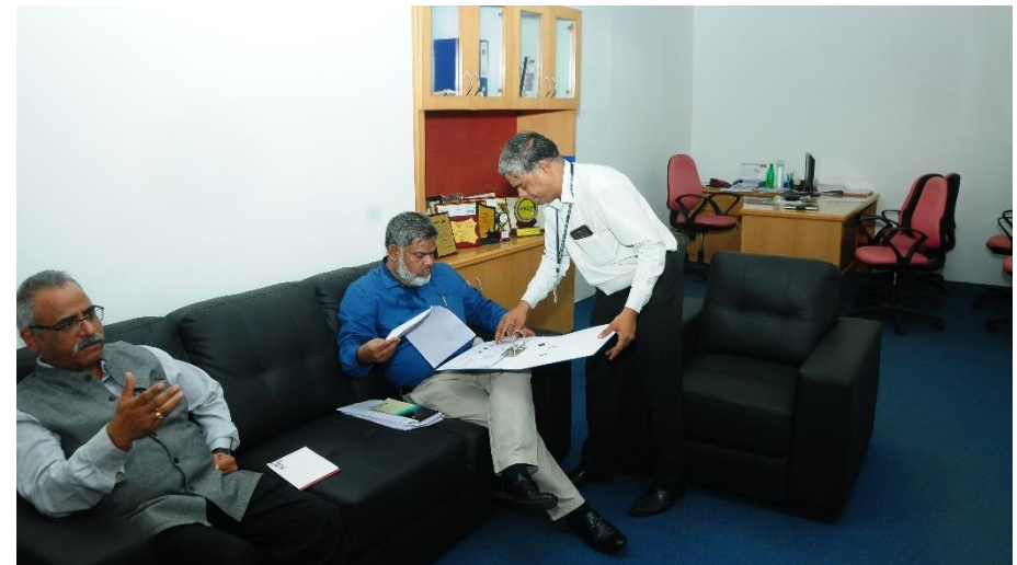
Fig. 24 Visit to Centre for Corporate Relations – Career Counselling – Placement Office