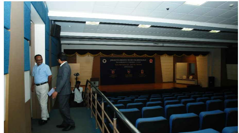
Fig. 20 Visit to Auditorium