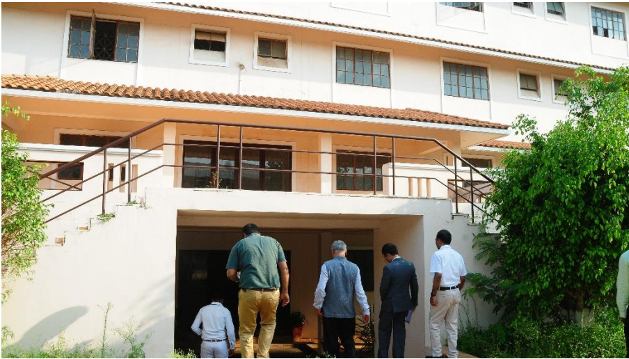
Fig. 21 Visit to Sports and Fitness Facility - Gym