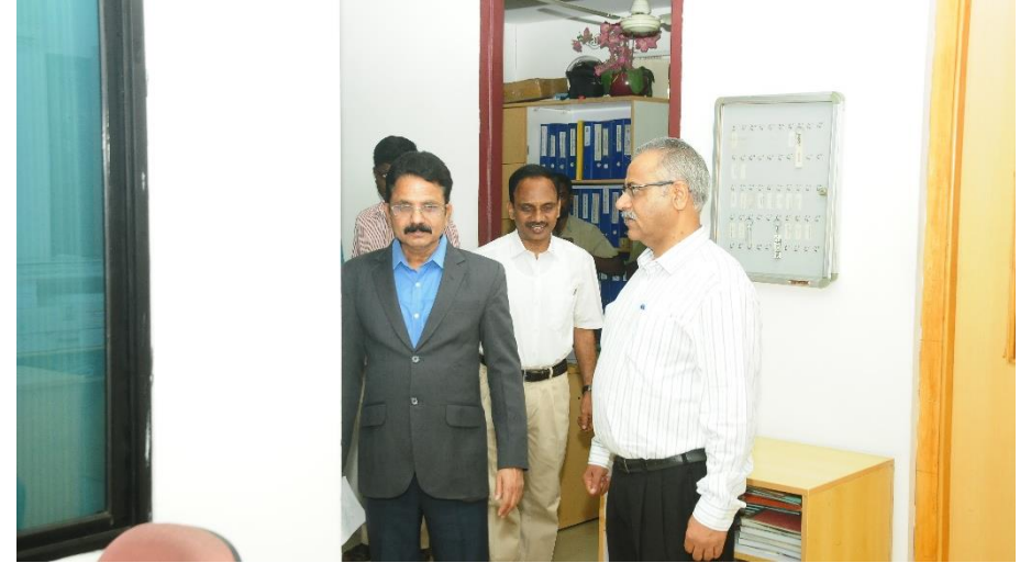
Fig. 35 Visit to Office - Discussion with AO – Accounts Office - Office staff