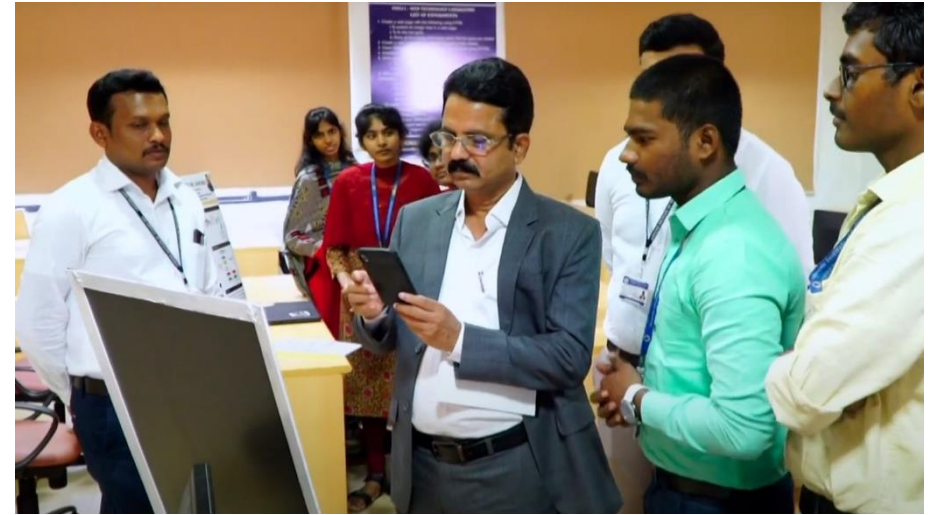
Fig. 7 Visit to Artificial Intelligence and Data Science Department