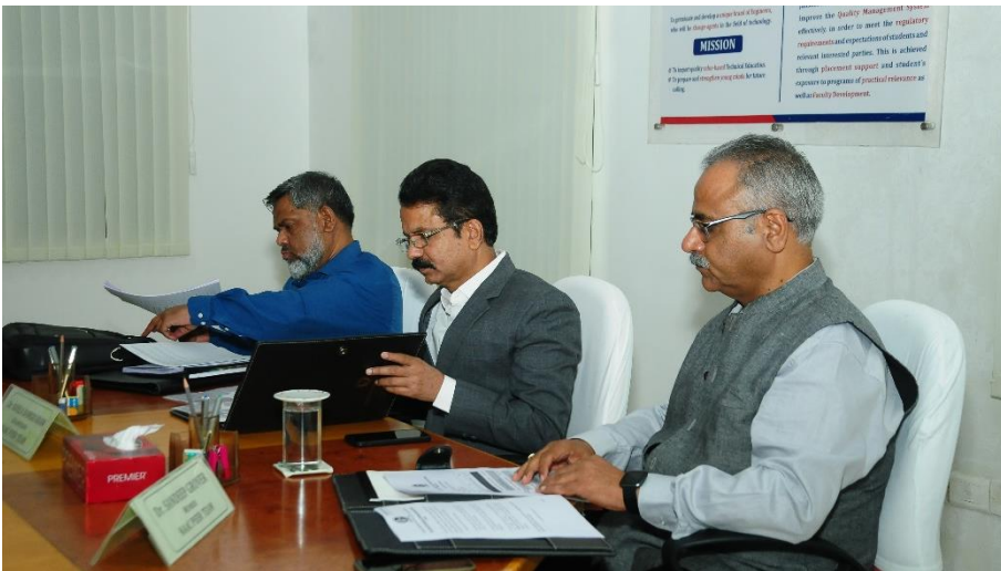
Fig. 2 NAAC Peer Team Members