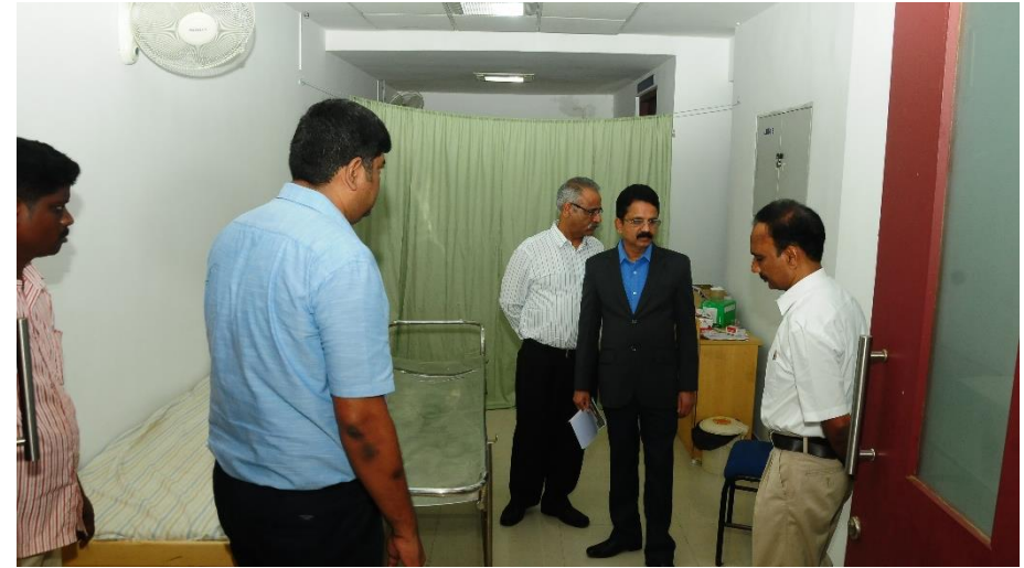
Fig. 31 Visit to Medical Room