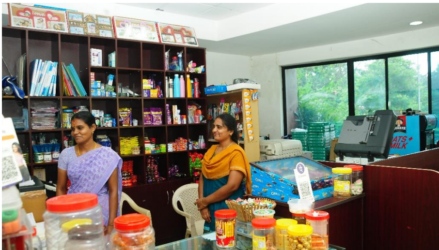
Fig. 30 Visit to Stationery