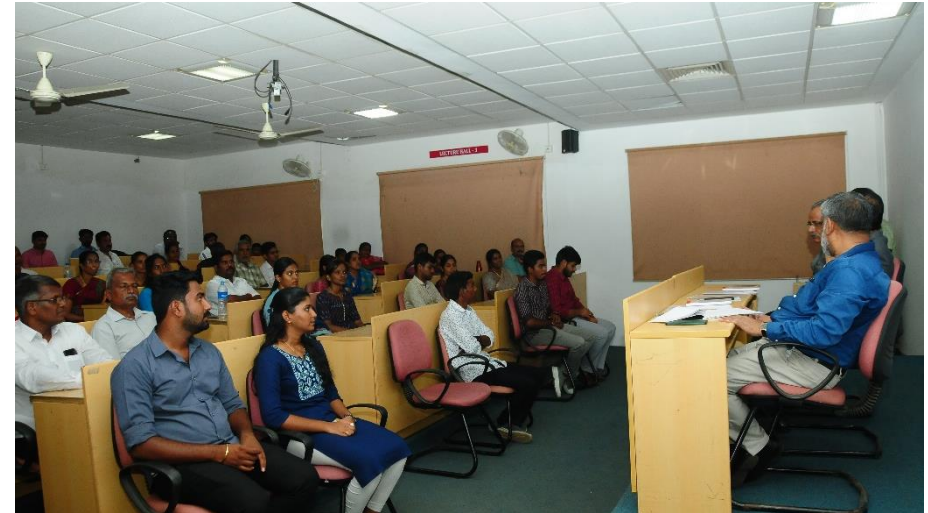
Fig. 27 Meeting Parents – Alumni – Students – Faculty – Staff