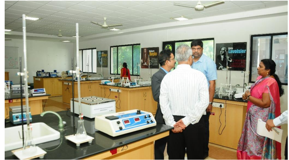
Fig. 12 Visit to Laboratories