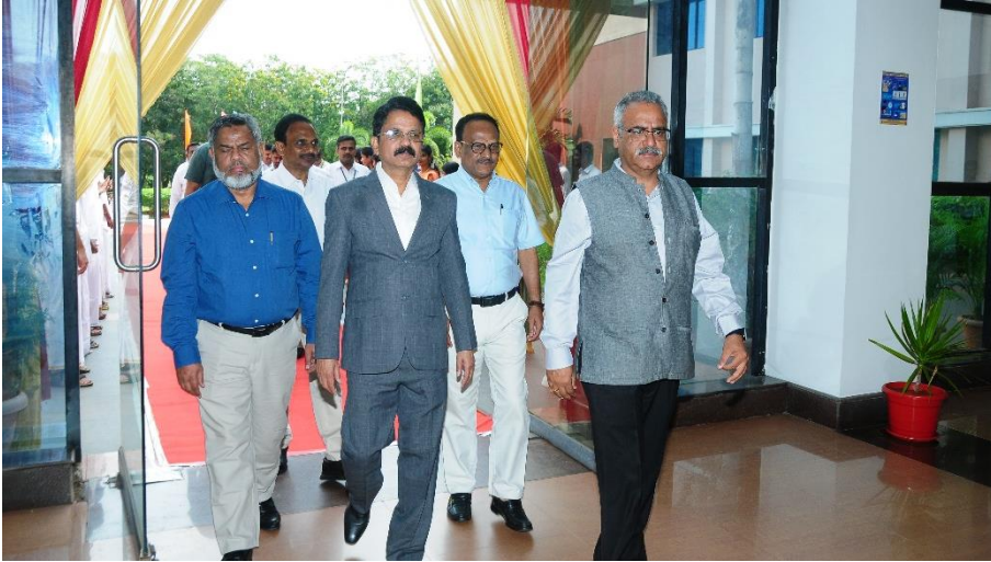
Fig. 1 Arrival of NAAC Peer Team at Campus