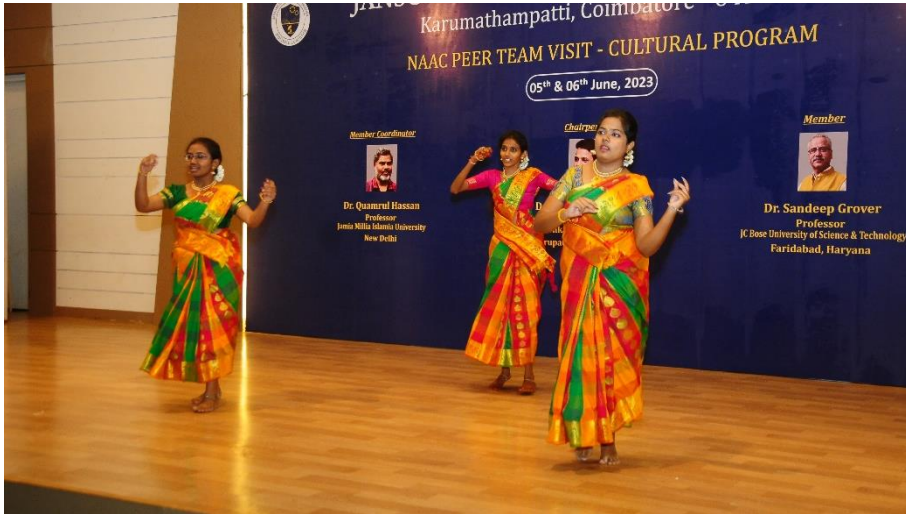
Fig. 37 Cultural Programmes by Students