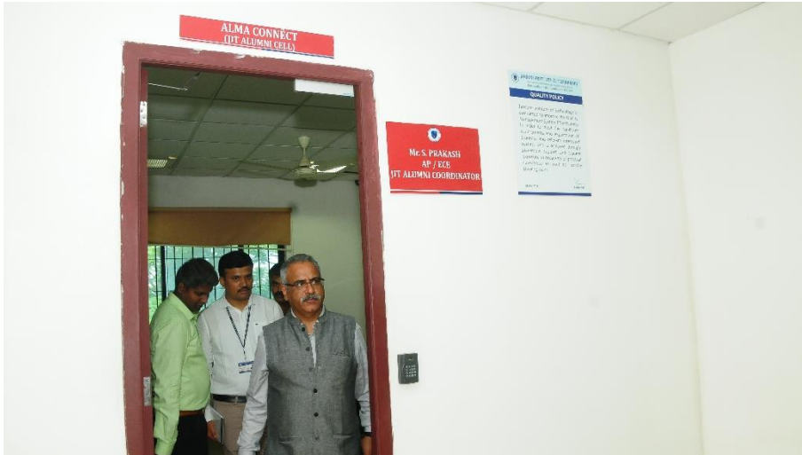
Fig. 25 Visit to JIT Alma Connect – Alumni Relations Office – Alumni Association