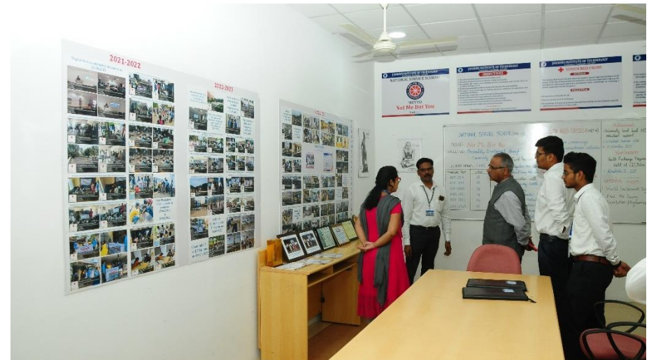
Fig. 16 Visit to NSS – YRC – RRC Office