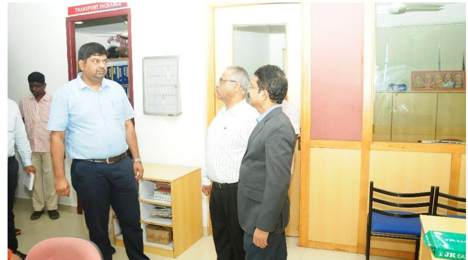
Fig. 36 Visit to Office - Discussion with Director Administration