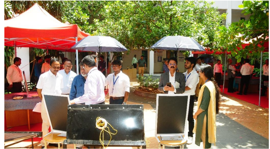
Fig. 15 Best Practice Display