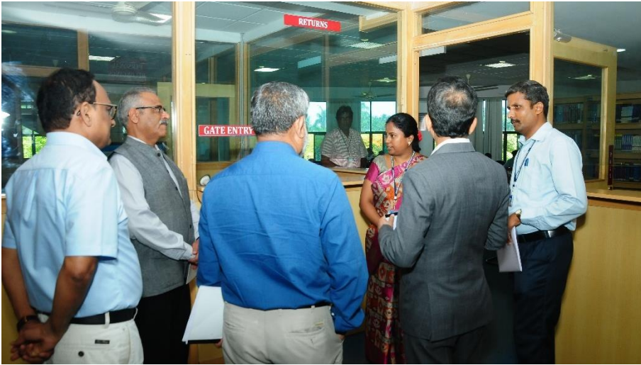
Fig. 17 Visit to Library