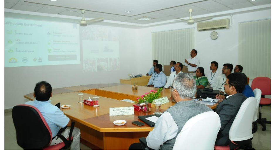
Fig. 3 Presentation by the Head of the Institution