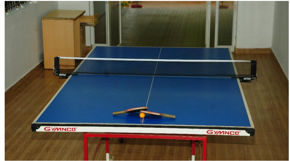
Fig. 23 Sports and Fitness Facility – Table Tennis Indoor Facility