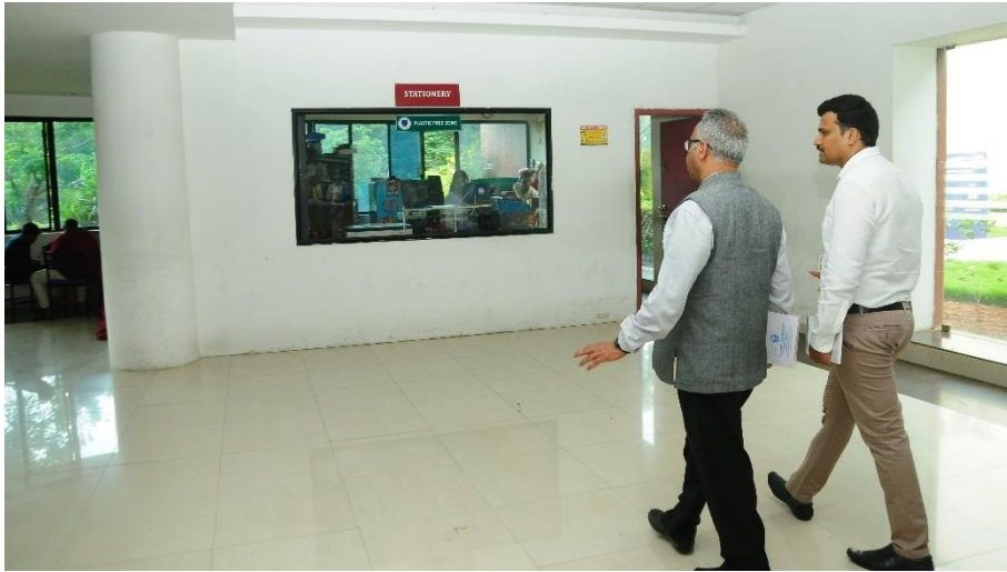
Fig. 29 Visit to Student Amenity