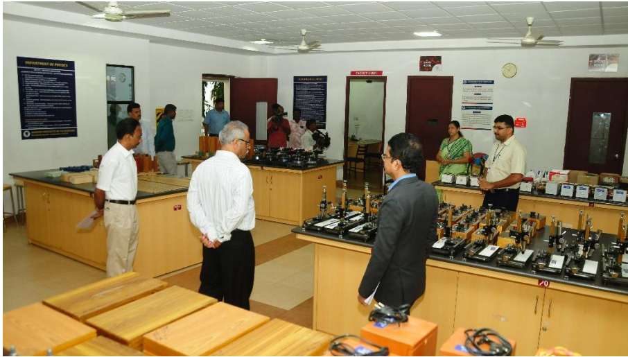
Fig. 13 Visit to Laboratories