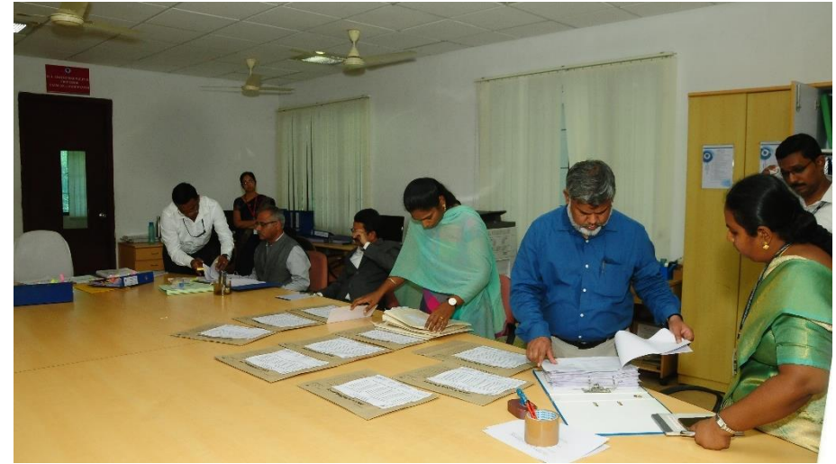
Fig. 11 Visit to Exam Cell