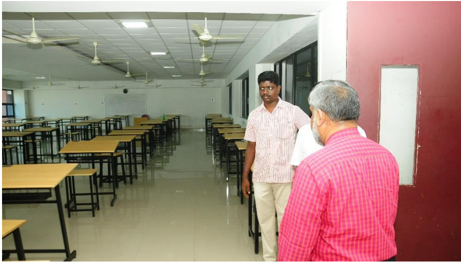
Fig. 45 Visit to Drawing Hall