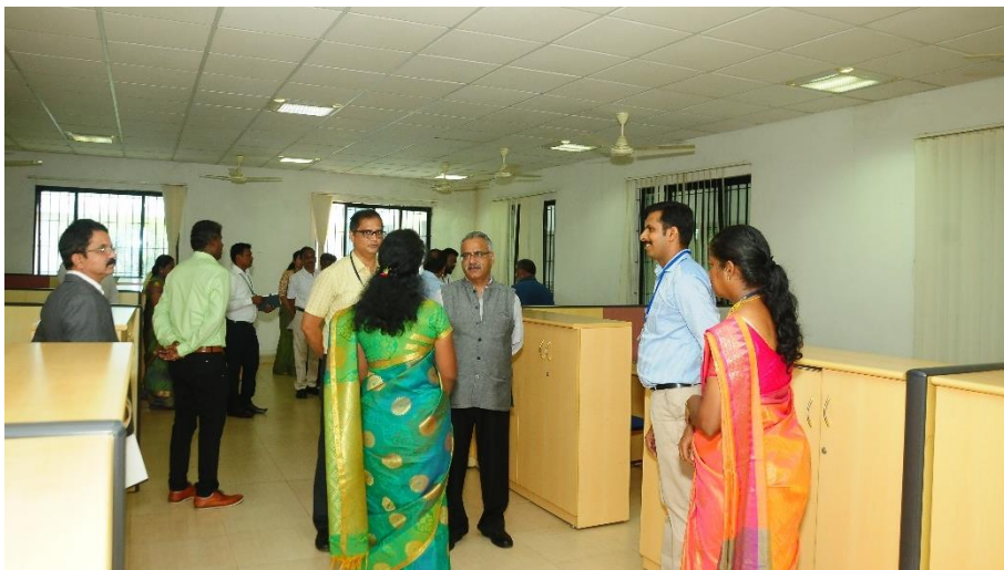
Fig. 10 Visit to Science and Humanities Department