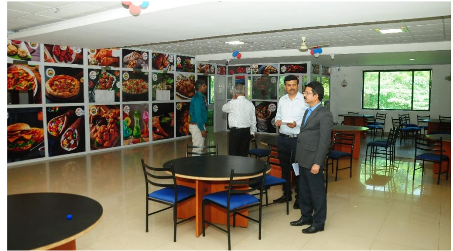
Fig. 40 Visit to Canteen