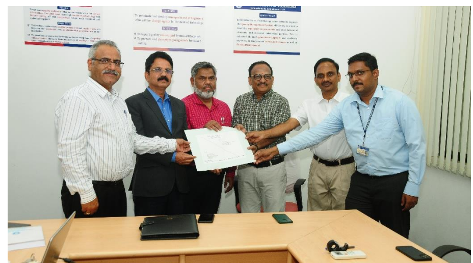
Fig. 48 Exit Meeting – Sharing of PTV Report