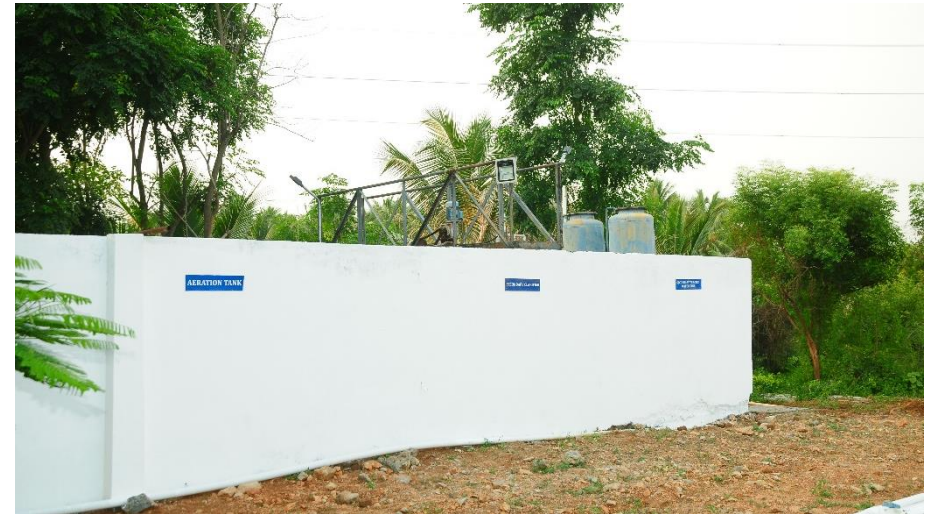
Fig. 39 Waste Management - Visit to STP