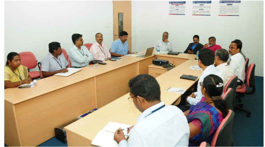
Fig. 47 Exit Meeting