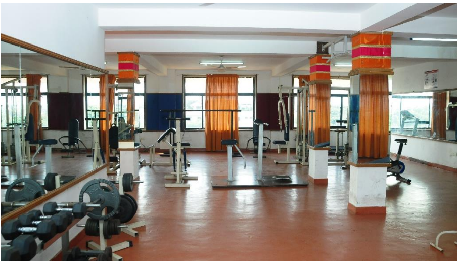
Fig. 22 Sports and Fitness Facility - Gym