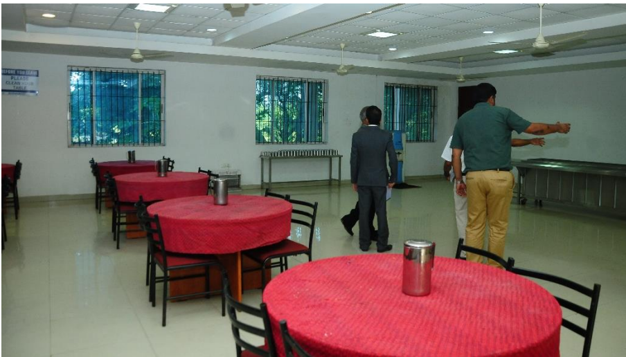
Fig. 34 Visit to Students Dining Hall