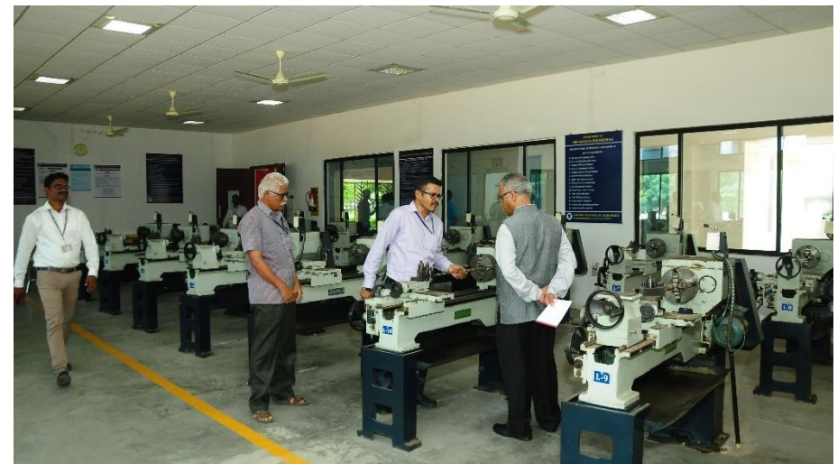
Fig. 8 Visit to Mechanical Engineering Department