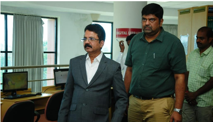
Fig. 18 Visit to Digital Library