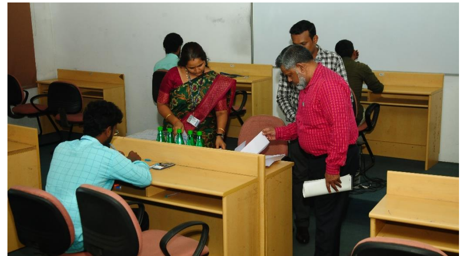
Fig. 44 Visit to Exam Hall