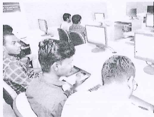
Students listening to the program