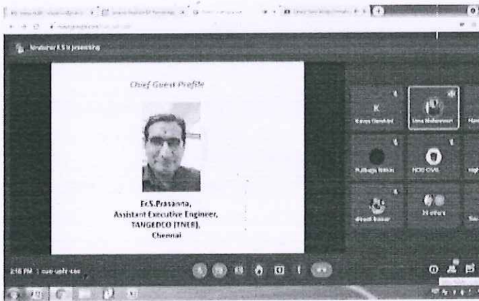
Student presenting the guest profile