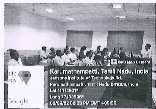
Students Queries and Discussion