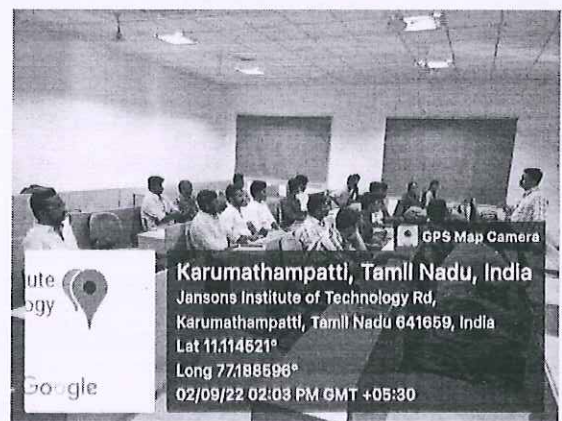
Encouraging to generate Idea