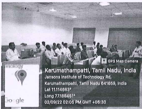
Problem Statement identification