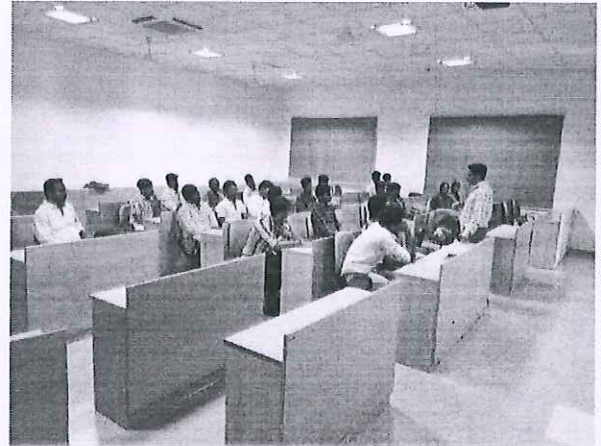
Discussion with students