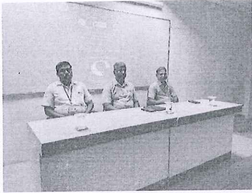
Arrival of all dignities on dais