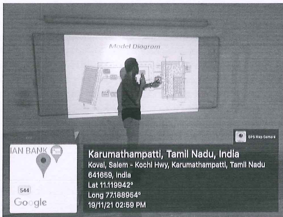
Idea presentation by the final year mechanical engineering student