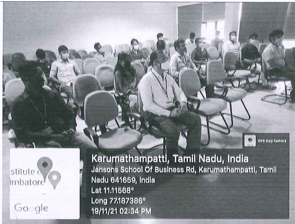
A Part of Participants

INSTITUTION'S INNOVATION COUNCIL (Ministry of Education, Govt. of India)