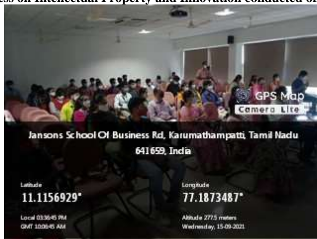
Figure 2 Session on Role of patents in Engineering domain and types of protection- 16.9.21, Student audience listening to the seminar