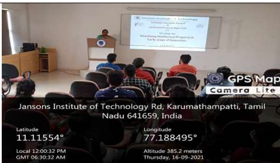
Figure 4 Session on Identifying Intellectual property in early stage of Innovation by Dr.T.Meenakshi, IPR cell coordinator