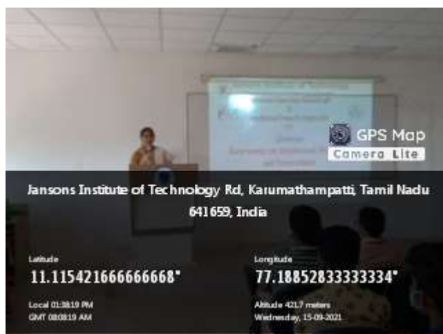
Figure 3 Dr.E.S.Shamila, Editor of IJCESET journal addressing the audience on copyright