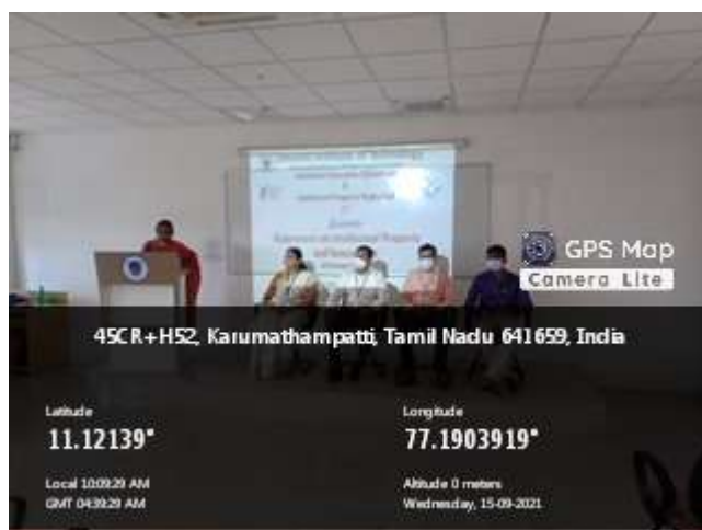
Figure 1 Session on Awareness on Intellectual Property and Innovation conducted on 16.09.21

awareness on IP and innovation among the students.